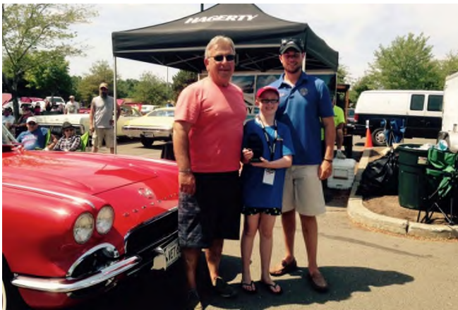
The Hagerty trophy went to the owner of this 1962 Corvette.