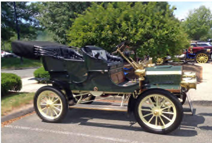
A rarely seen 1905 Ford Model F.