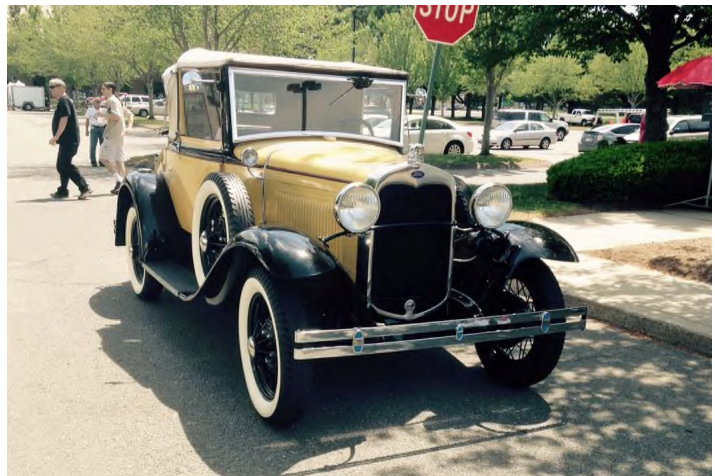
A 1930 Ford Model A Cabriolet is the feature car for the 2015 show and is owned by Nick Nesci.