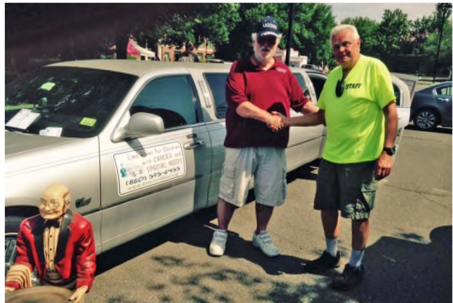
The 50/50 drawing produced $225 for Kids in Limos and $225 for the winner.